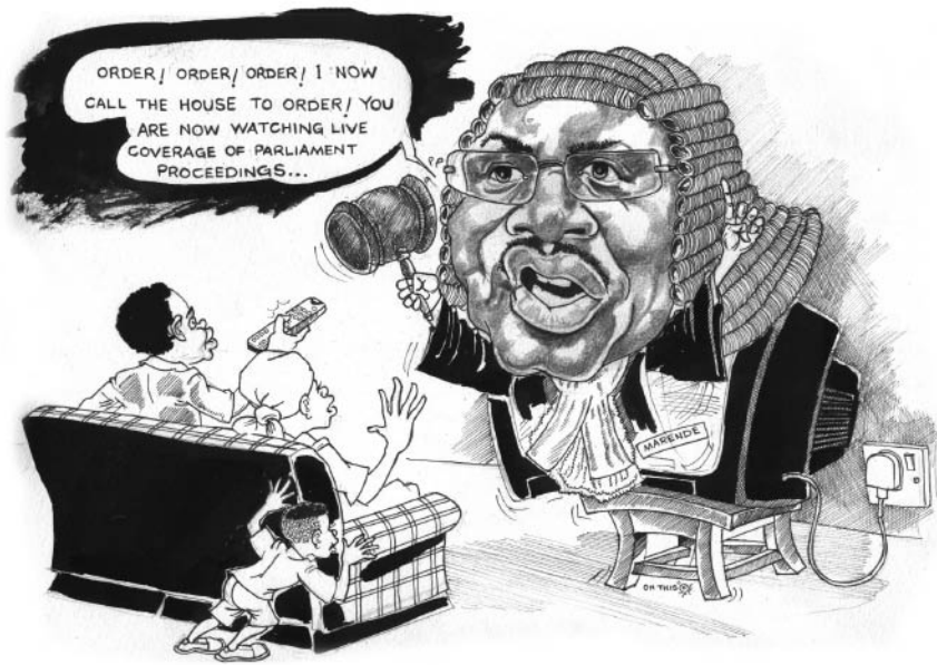
Haki yako urithi wako