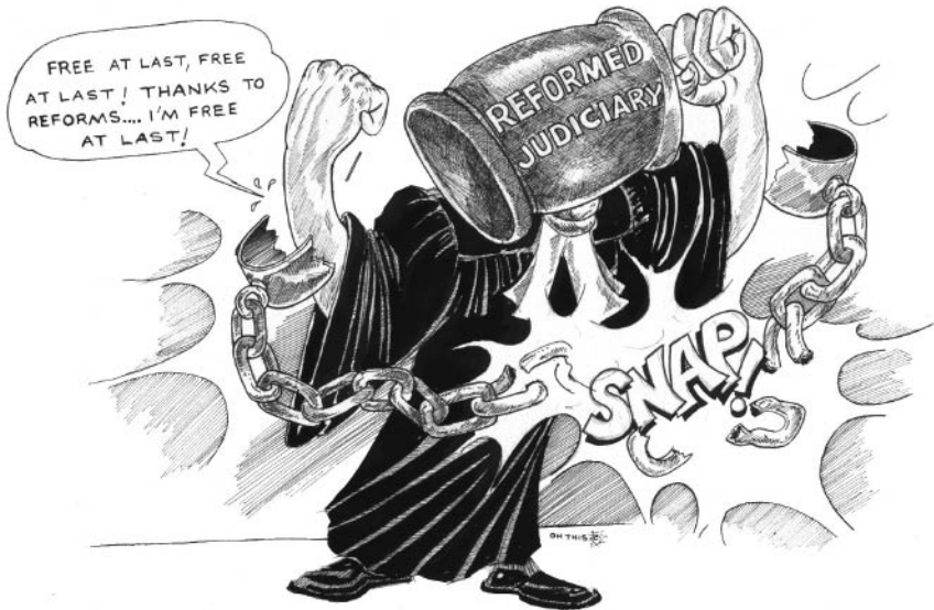
Haki yako urithi wako