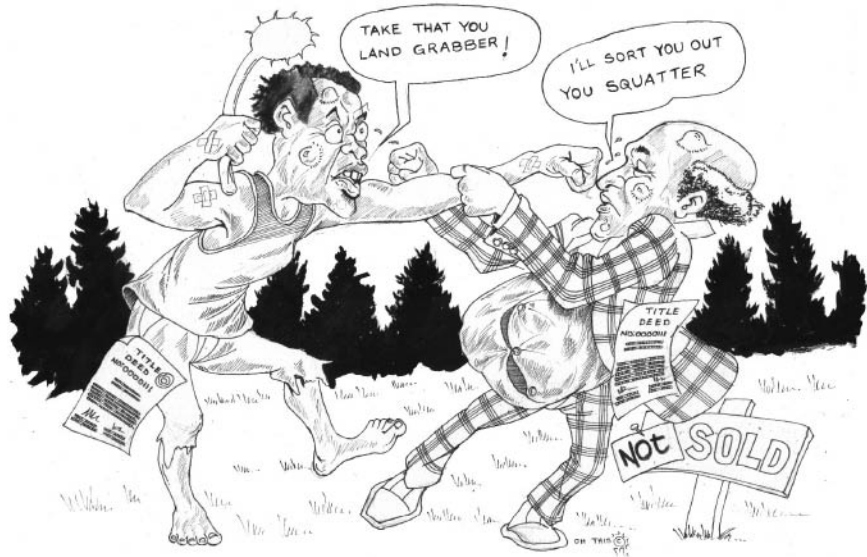
Haki yako urithi wako